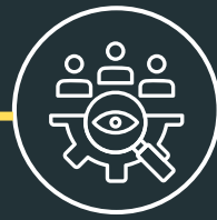
Infrastructure Planning & Operational Management