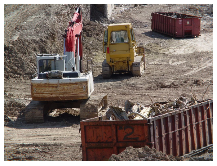
Construction waste should be collected in designated waste collection areas on-site, such as metal dumpsters.